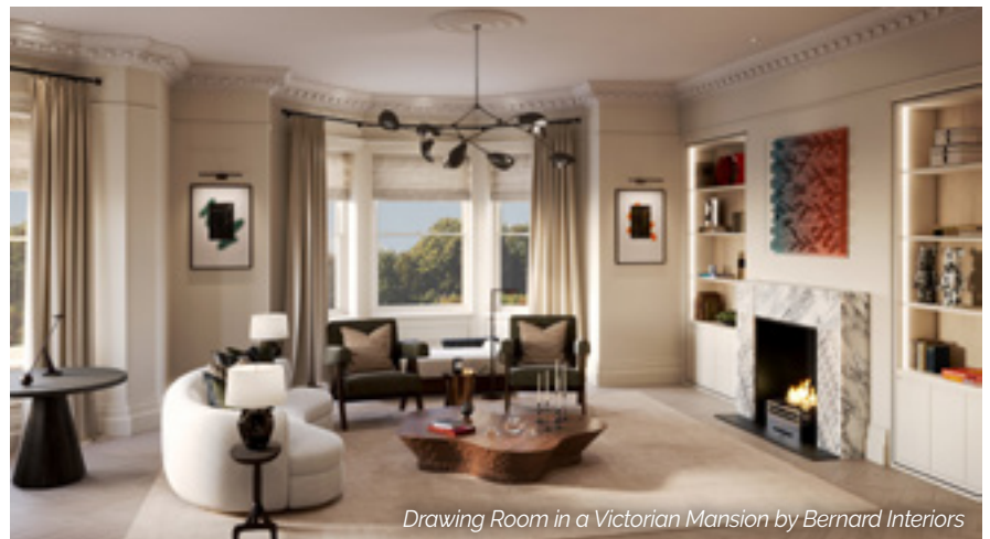
Drawing Room in a Victorian Mansion by Bernard Interiors

www.bernardinteriors.co.uk IG: @bernardinteriors