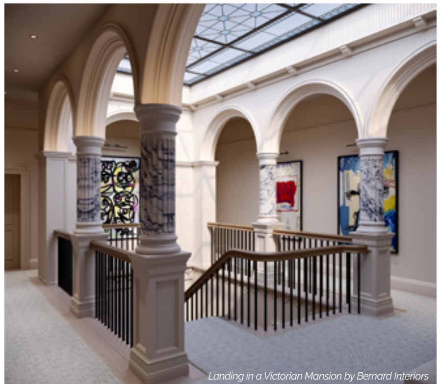
Landing in a Victorian Mansion by Bernard Interiors